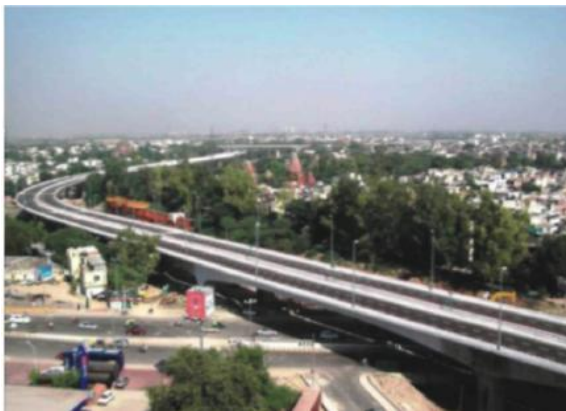
Fig 14: Barapullah Corridor (upto J N Stadium in Phase 1)

The alignment which is along Barapula Nala drain collects the discharges of other internal, peripheral and trunk drains to further discharge its contents-1,25,000 Kid of domestic sewage into the Yamuna.