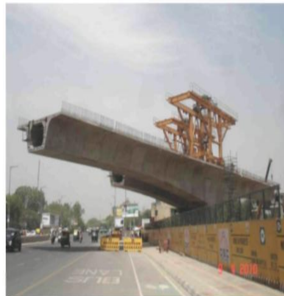
Fig 18: No Disturbance to Road Traffic during Precast Segmental Construction