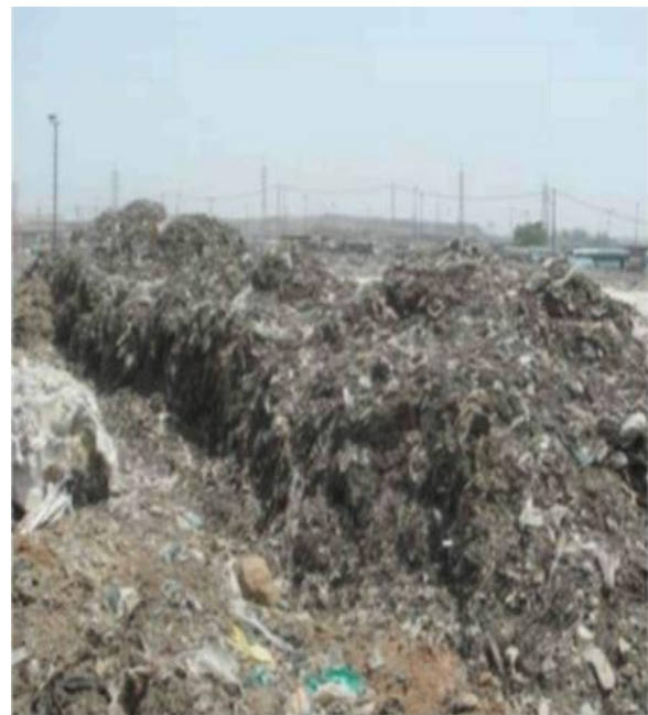
Fig 7: Land Fill