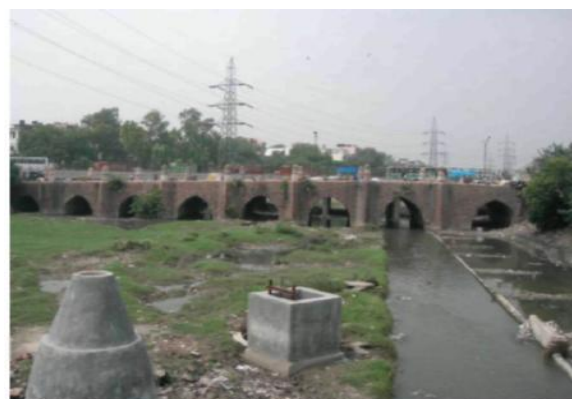
Fig 15: A View of Barapullah Nallah