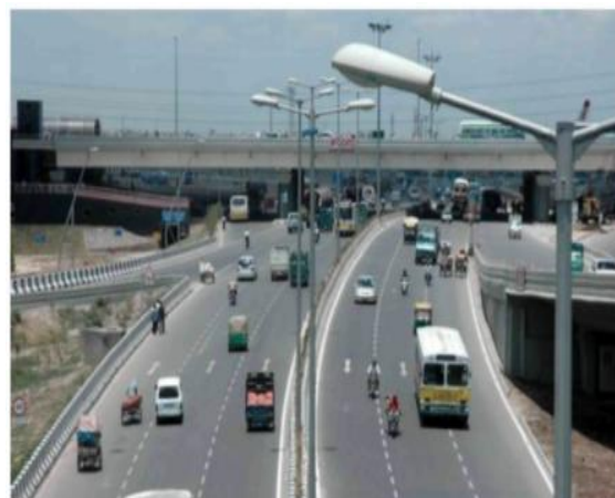
Fig 4: View of Azadpur End