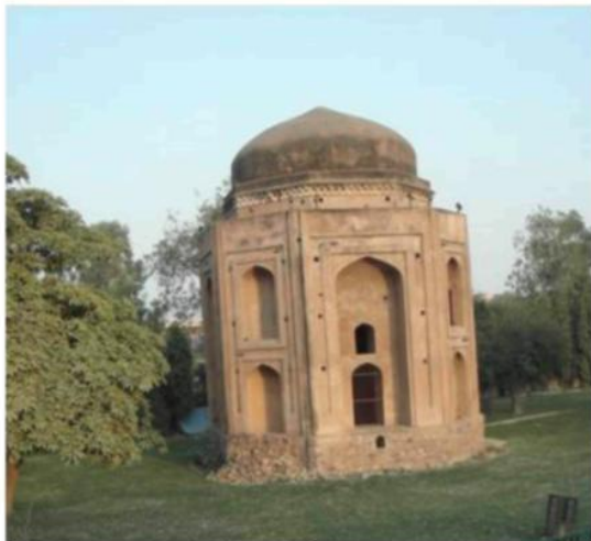
Fig 9: Archeological Monument