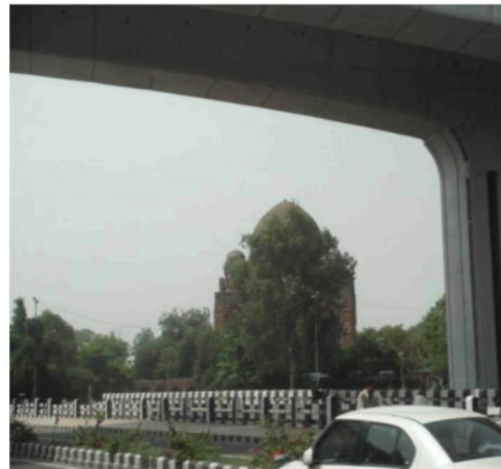
Fig 17: Khan-e-Khana's Tomb in View