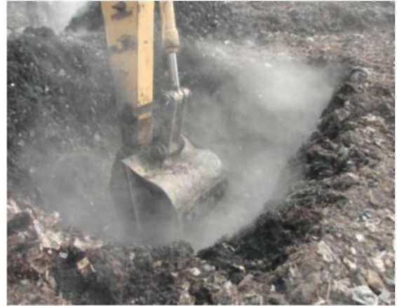
Fig 11: Excavation in the Landfill Area