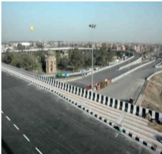
Fig. 6. Incorporation of Archeological Monument in the Scheme