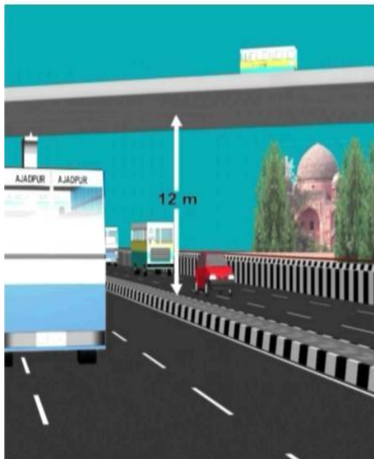
Fig 16: Planning of Khan-e-Khana's Tomb