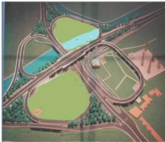
Fig 3: Completed View of Mukarba Chowk Grade Separator