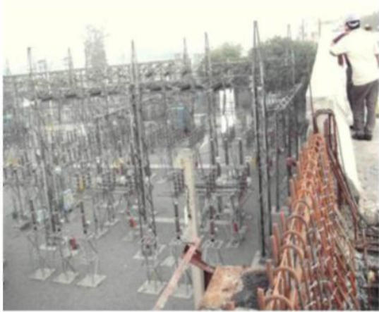
Fig 8: Major Electric Sub Station