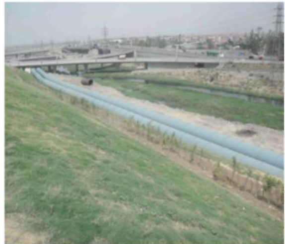
Fig 12: Landfill Converted into a Green Belt