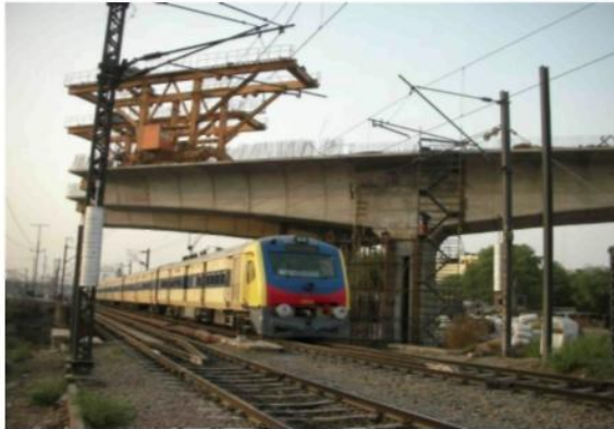
Fig 20: No Physical Disturbance to Heritage Structure