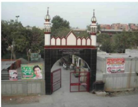
Fig 10: Burial Ground